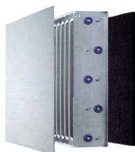
Filter construction: Pre filter » ElectroMax filter » Activated carbon filter

Phase 3: finally the activated carbon filter adsorbs unpleasant odours, like for example from cigarettes and cigars.